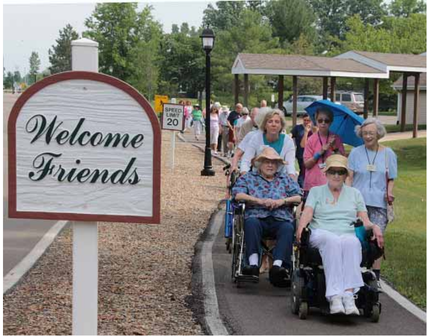
Kendal residents, staff members and the Kendal Early Learning Center children and staff participated in the CommUnity Walk on Friday, June 12 as Fun Fitness Week came to a close. The Walk was followed by the FFW Recognition Luncheon in Fox & Fell.