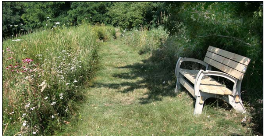
Check out the view from the new bench on Wildflower Hill.